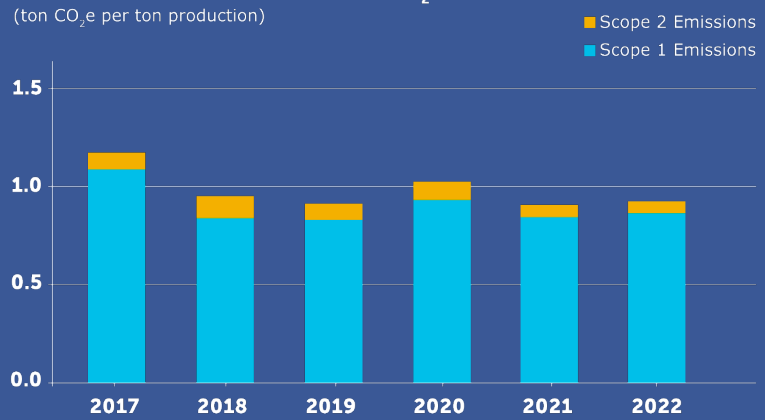
Scope 1: Greenhouse gas emissions released directly from Westlake Chemical Partners LP assets, assuming 100% ownership of OpCo.

Scope 2: Indirect greenhouse gas emissions released from the energy purchased for Westlake Chemical Partners LP assets, assuming 100% ownership of OpCo.